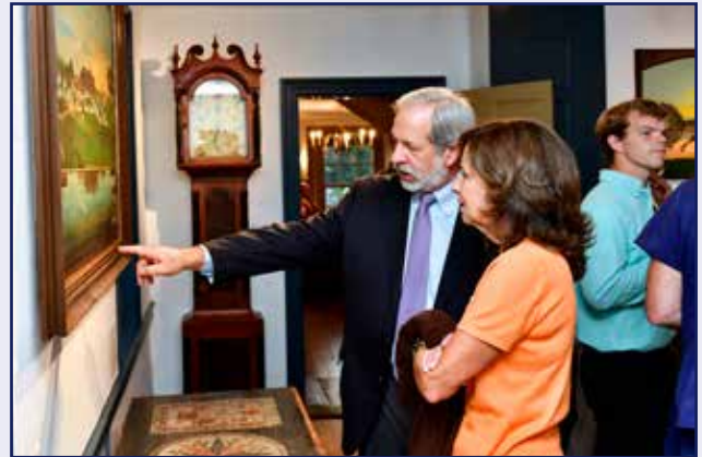
Guests enjoying the preview party