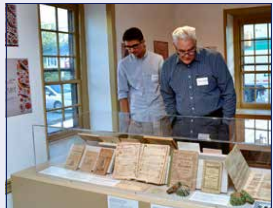
Highlights from the Roots exhibit